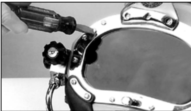
Remove the two plug screws from the port retainer.