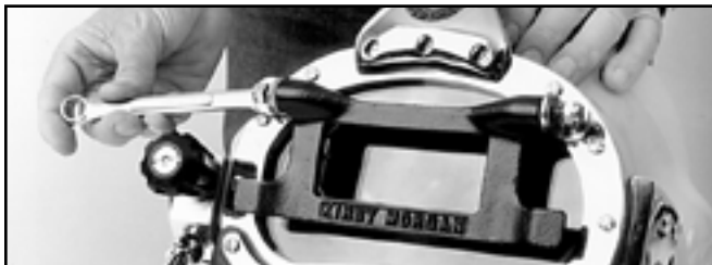
Tighten the weld lens assembly.

4) Tighten the two lock nuts on the ends of the hinge studs so that the welding lens assembly can be flipped up, but will not fall down from its own weight.