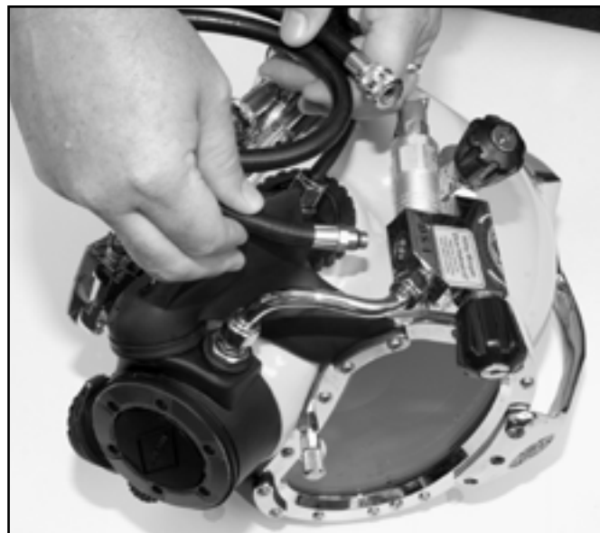
Thread the hose into the side block opening.

When using the low-pressure port on the side block for attachment of a low-pressure hose, a hose with built in flow restriction or the KMDSI Flow Restrictor Adapter, P/N 555-210 must be used. Without a restrictor, a hose failure could deplete the Emergency Gas Supply very rapidly leading to suffocation. This could result in serious personal injury or death.