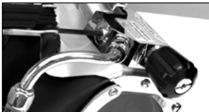
Remove the plug from the side block and install the inflator hose here.