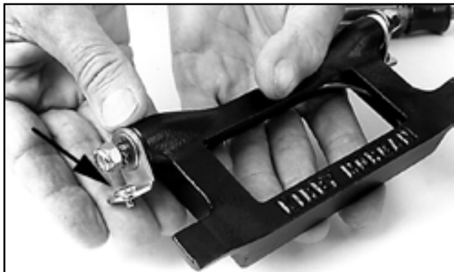
Install the screws through the mount ears.